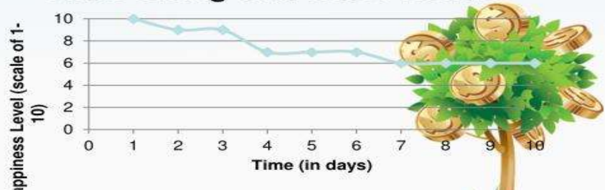
Happiness Level Over Time After Going Out With Friends